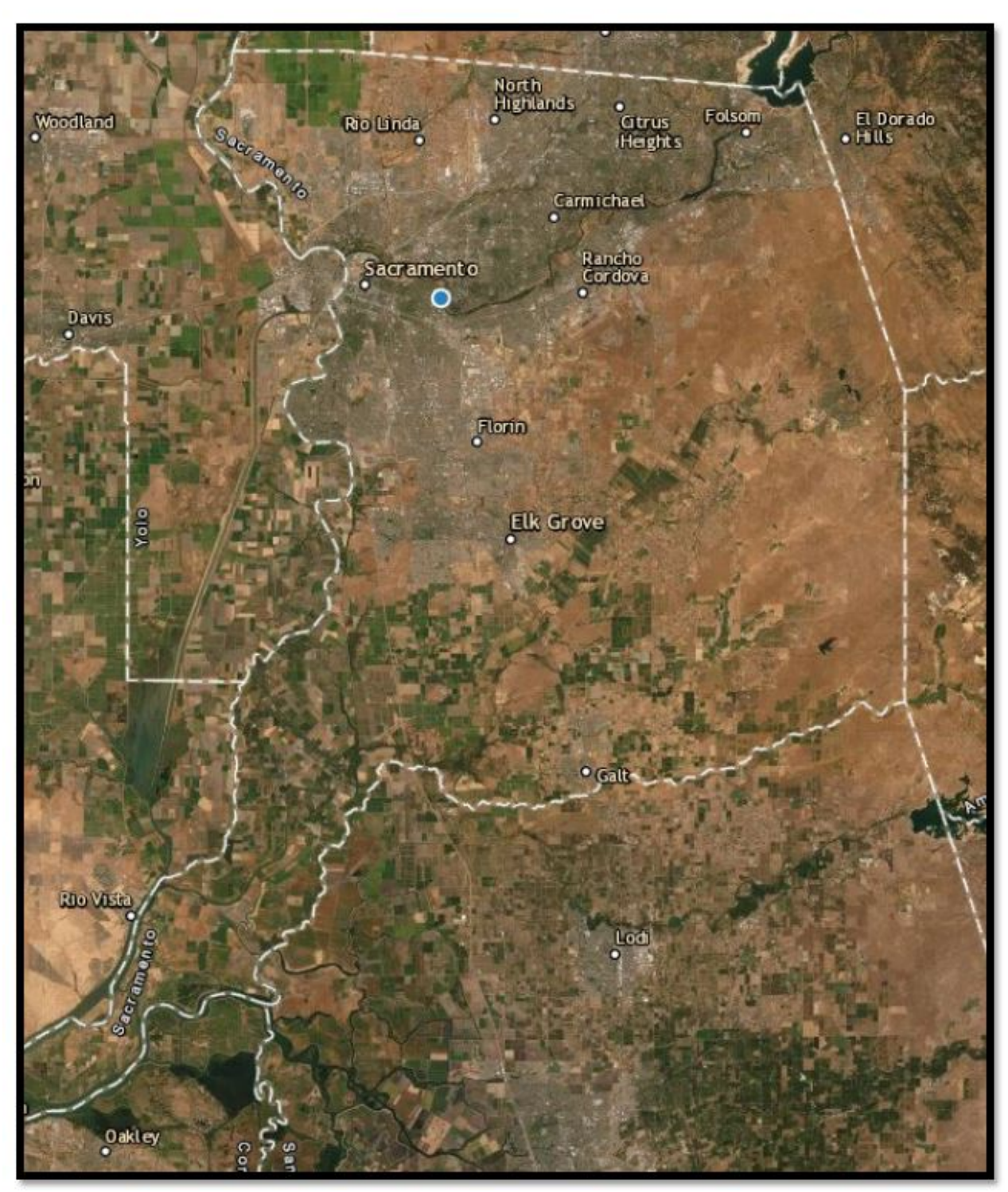
1) Vicinity map