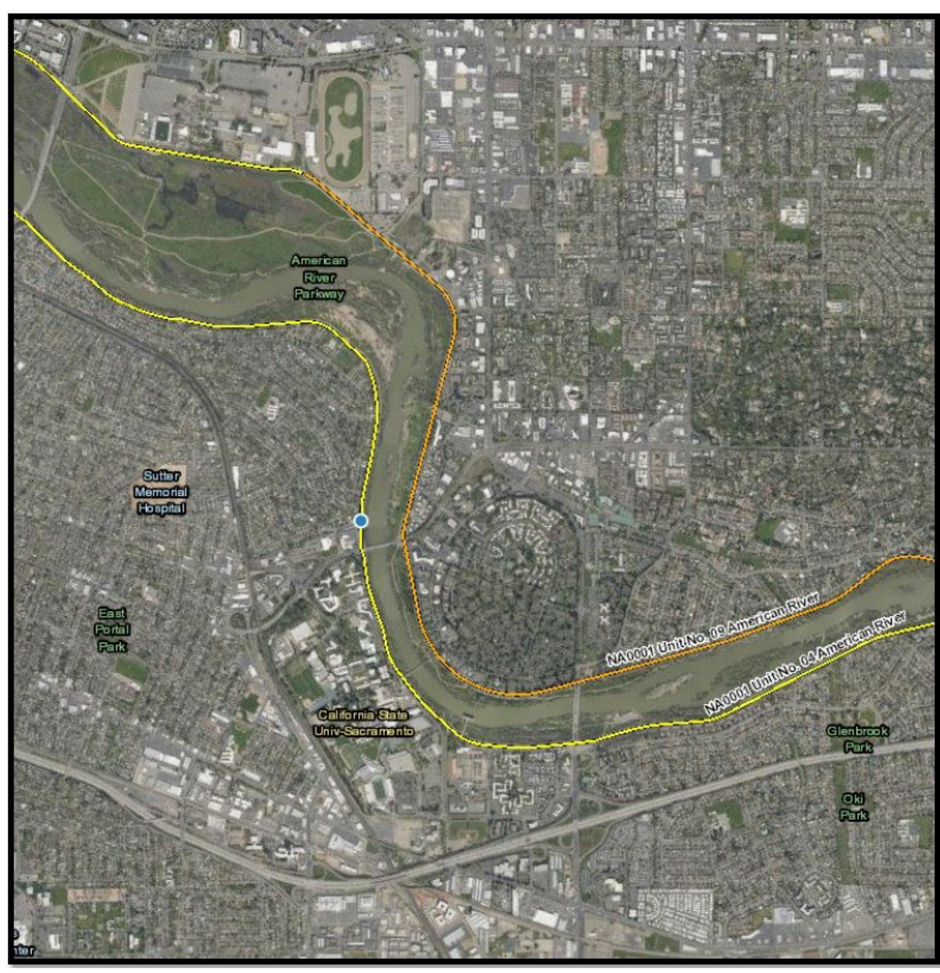
2) Location map